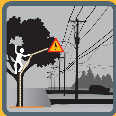
Never climb trees that are near a power line.

Electricity is always trying to find a way to get to the ground: