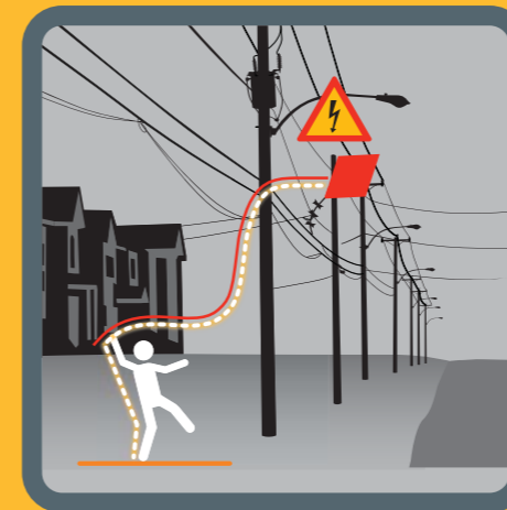
Never fly a kite near a power line, and don't grab a kite that is tangled in a power line.