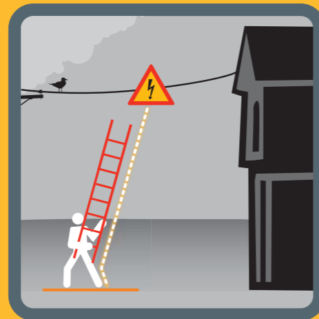
Always look up to locate power lines before using a ladder or any long tool.