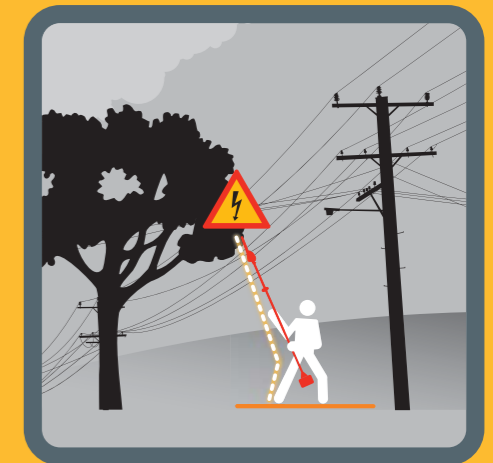
Don't prune trees that are near or touching a power line.